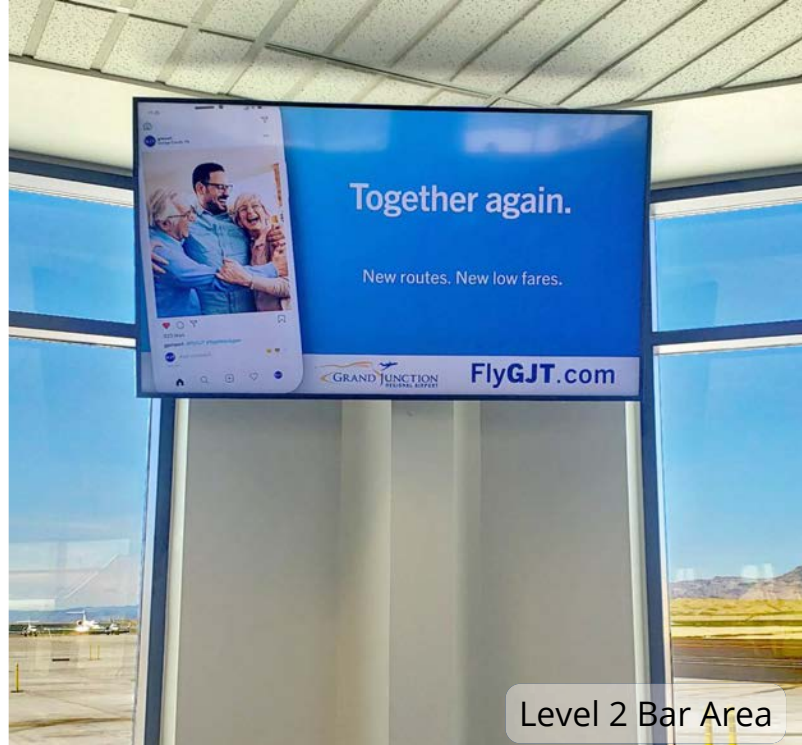
Level 2 Bar Area

Over half a million business and leisure passengers come through GJT every year.